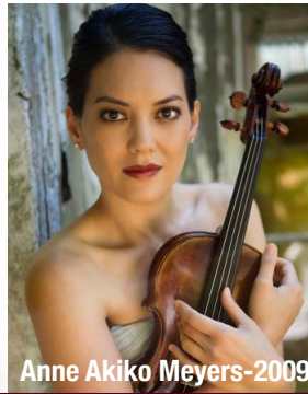
Anne Akiko Meyers-2009